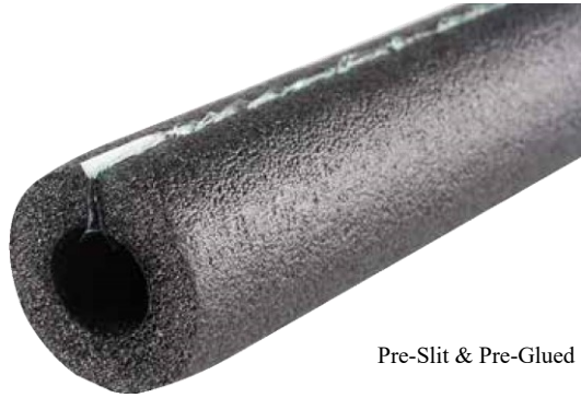
Pre-Slit & Pre-Glued