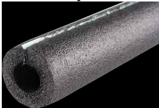
Pre-Slit & Pre-Glued