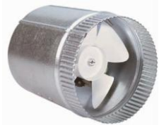
Air Booster (AB)