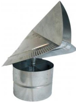
Wind Directional Cap